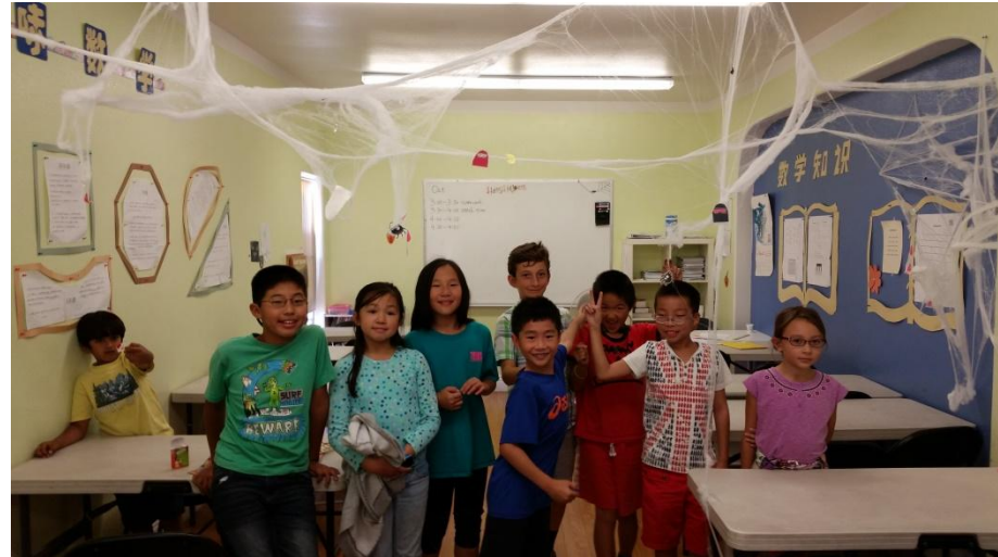
Students started to decorate their classrooms for Halloween

You think it's easy to build a self supporting Bridge. Ask your children about Leonardo's Bridge and they will explain to you how to do it.