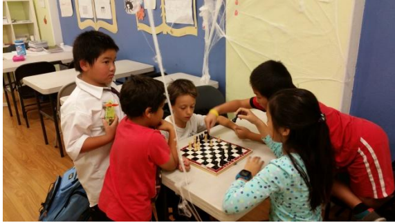
No matter how old, chess is for all.